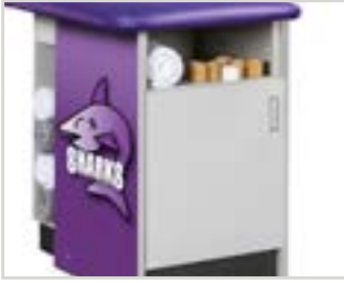
825 Option Team Logo Laminate Side Panel Cabinet Style Style (All Models)