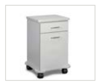
042 Cart Option 1 Drawer & 1 Door