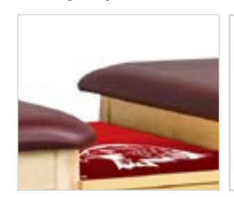
823 Option Laminate Countertop for Classic Taping Stations