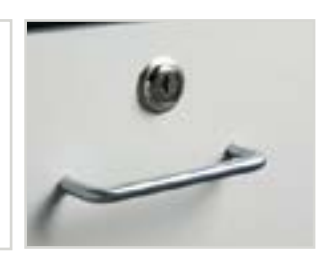
710 Option Door & Drawer Locks