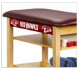
721Option Team Logo Side Panels/ Classic