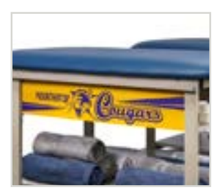
721Option Team Logo Side Panels (All Ironside Models)