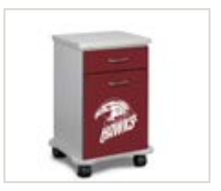
718-CM Laminate Logo Door with Cart Option