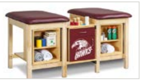
824 Option Team Logo Laminate Doors Classic Style (models 1705, 1707, & 1707)