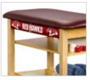
7210ption Team Logo Side Panels (All Classic Models)