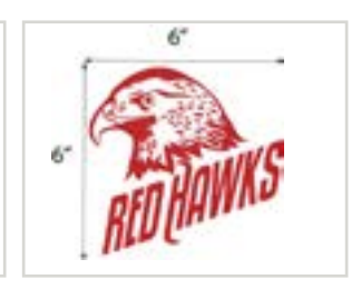
830 Option Team Logo Wall Sticker 6" x 6" Max

WARNING: Products on this page can expose you to chemicals, including vinyl chloride, which is known to the State of California to cause cancer. For more information go to www.P65Warnings.ca.gov.