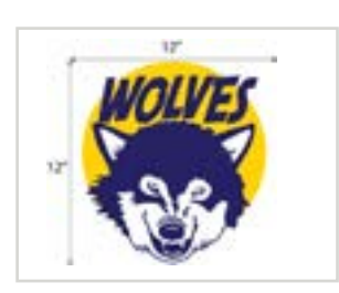
831 Option Team Logo Wall Sticker 12" x 12" Max