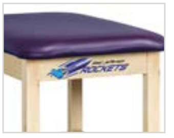
728 Option Team Logo Vinyl Sticker on Classic Table Frame