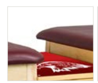
823 Option Laminate Countertop for Classic Taping Stations