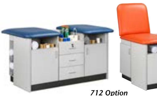
Two Drawer/Door Conversion