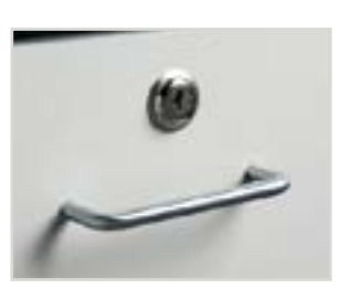
710 Option Door & Drawer Locks