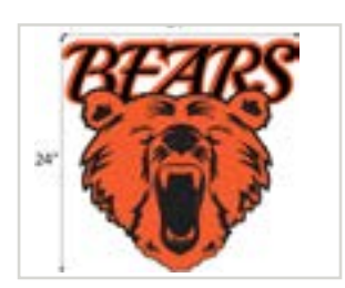
729 Option Team Logo Wall Sticker 24" x 24" Max