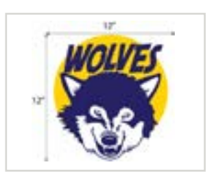
831 Option Team Logo Wall Sticker 12" x 12" Max