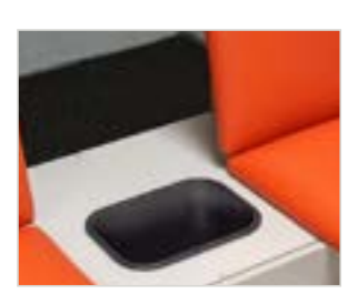
715 Option Drop-In, Waste Hamper for Taping Stations