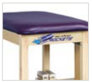
728 Option Team Logo Vinyl Sticker on Classic Table Frame