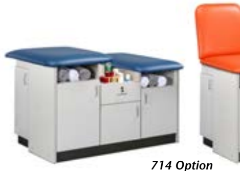
Special 42" Seat Section Height