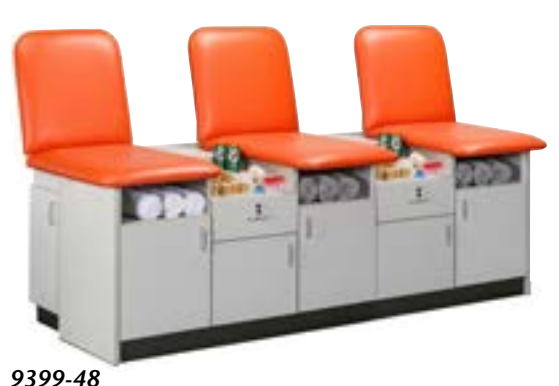
48" Cabinet-style, 3-Seat, Taping Station with Backrests