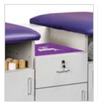
825 Option Laminate, Team Logo, Side Panel