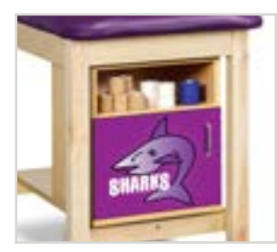
824 Option Team Logo Laminate Doors Team Logo Laminate Doors Classic (Model 17061 only)