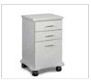
043 Cart Option 2 Drawers & 1 Door