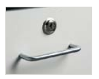
710 Option Door & Drawer Locks (models 1705, 1707, & 1707)