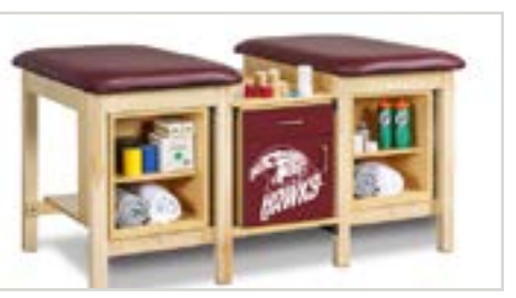
824 Option Team Logo Laminate Doors Classic Style (models 1786 & 1787)