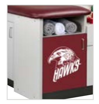
824 Option Team Logo Laminate Doors