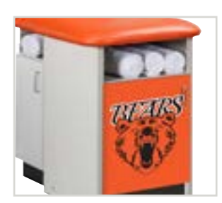
824 Option Team Logo Laminate Doors Cabinet Style (All Models)