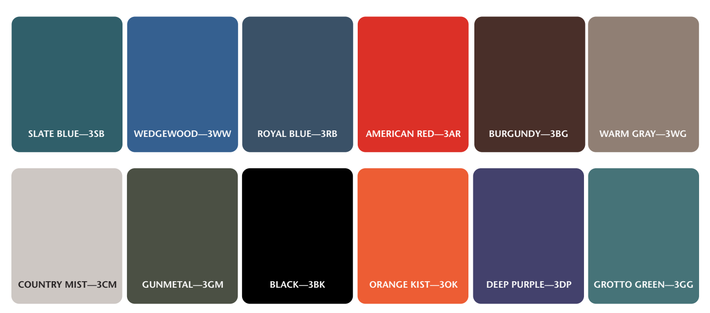
NOTE: Other colors may be available by request, although it may result in longer wait times for delivery.