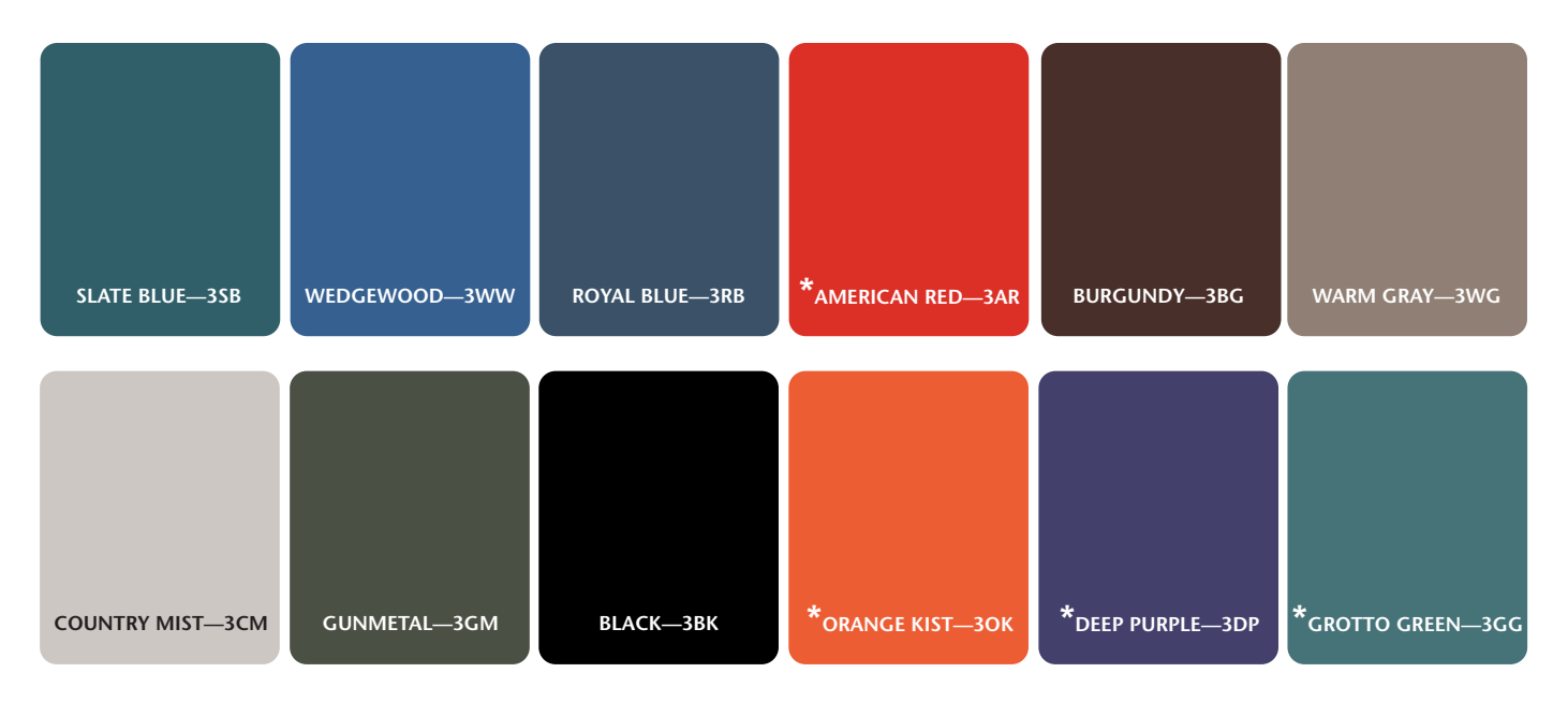
*UPCHARGE FOR THESE SPECIAL COLORS

NOTE: Other colors may be available by request, although it may result in upcharges and longer lead times.