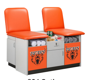
824 Option Laminate Door with Team Logo