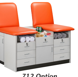
712 Option 3-Drawer Conversion