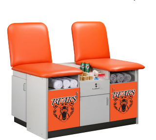
824 Option Laminate Door with Team Logo