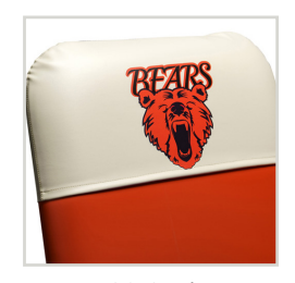
720 Option Logo Backrest Sleeve