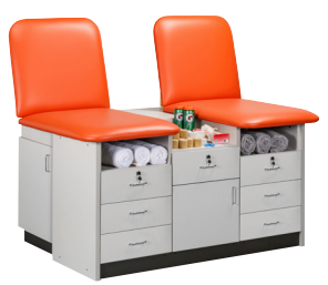
712 Option 3-Drawer Conversion