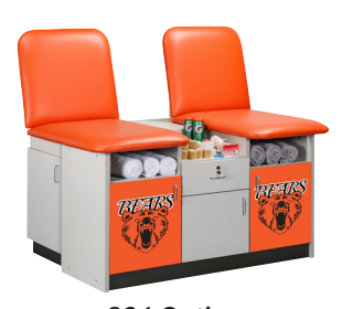
824 Option Laminate Door with Team Logo