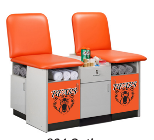
824 Option Laminate Door with Team Logo