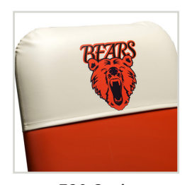
720 Option Logo Backrest Sleeve