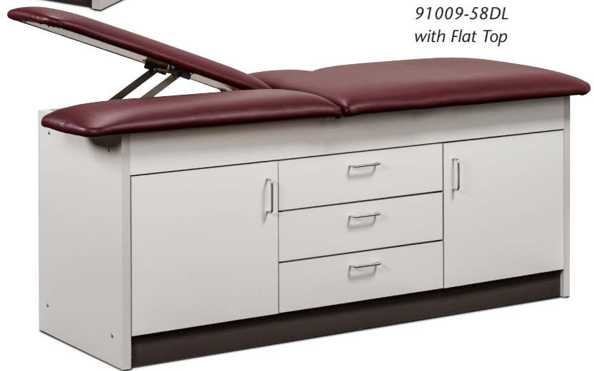
91009-58DL with Flat Top