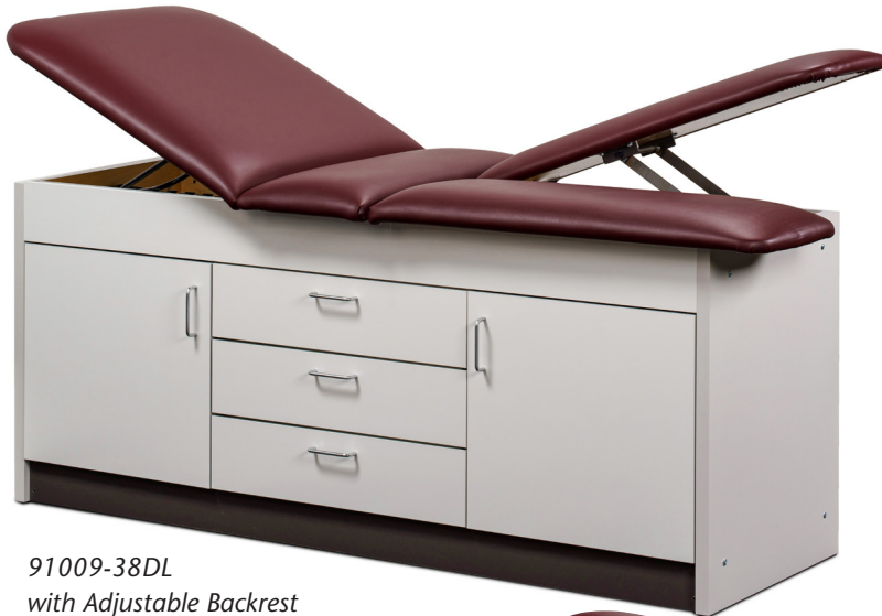
91009-38DL with Adjustable Backrest