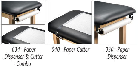
034- Paper Dispenser & Cutter Combo