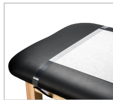
040 Paper Cutter