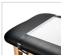
040 Paper Cutter