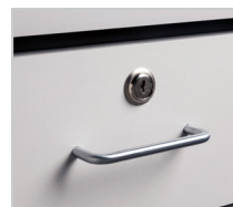
055 Drawer Locks