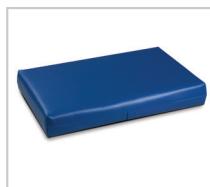
060 Large Pillow