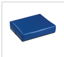
020 Small Pillow