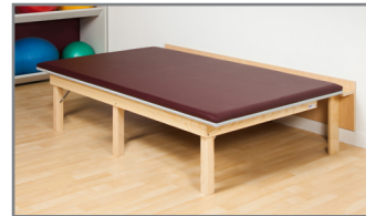
041 Maximum 21" High

Standard Upholstery Colors NOTE: Other colors may be available by request, although it may result in upcharges and longer lead times.