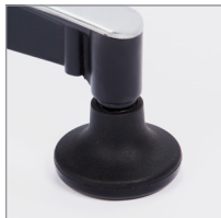
23 Optional Glides B