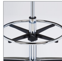
22 Optional Foot Ring