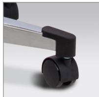
27 Scuff Protectors