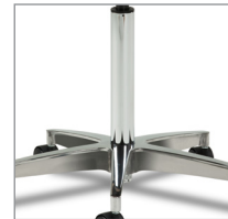
26 Extra Tall Pneumatic Cylinder

Standard Upholstery Colors NOTE: Other colors may be available by request, although it may result in upcharges and longer lead times.