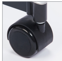
25 Soft-Roll Casters