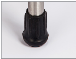
24 Optional Rubber Tips