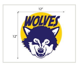
831 Option Team Logo Wall Sticker 12" x 12" Max