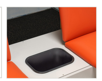
715 Option Drop-In, Waste Hamper for Taping Stations