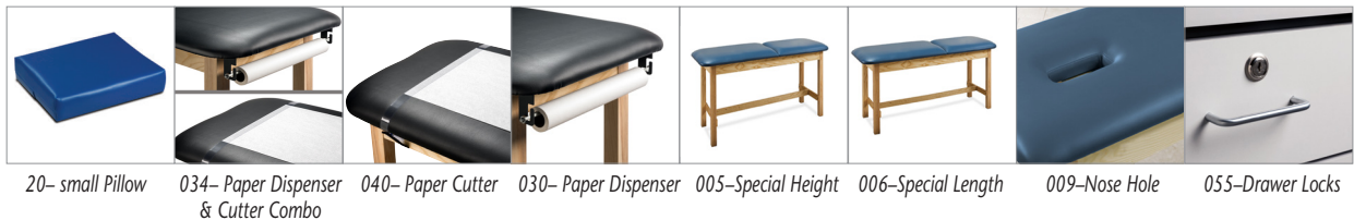
20- small Pillow 034- Paper Dispenser & Cutter Combo 040- Paper Cutter 030- Paper Dispenser 005- Special Height 006- Special Length 009- Nose Hole 055- Drawer Locks