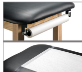
034- Paper Dispenser & Cutter Combo