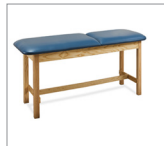
006- Special Length