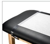
040- Paper Cutter