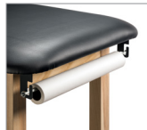
030- Paper Dispenser